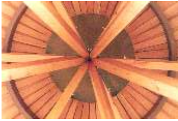
Glory Hole, Lincoln. A short listed entry in a national competition, hosted by Groundwork Lincoln, to improve a much neglected section of Lincoln river's edge.